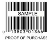
Sample of 12-digit UPC barcode